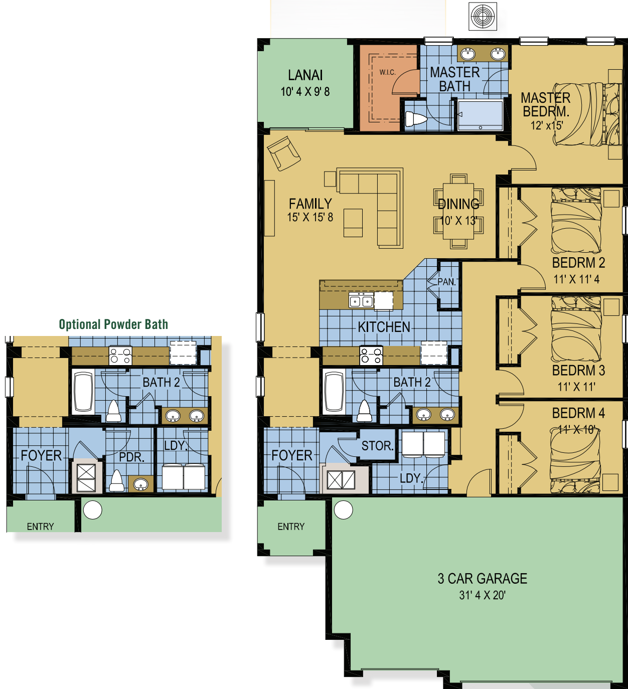
Optional Powder Bath